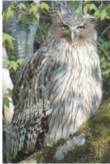
Photo 1. Blakiston's Fish Owl.