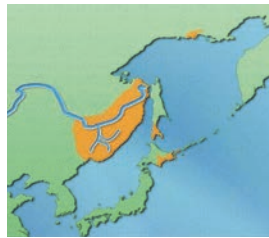
Fig. 1. Distribution of Blakiston's Fish Owls.

Blakiston's Fish Owls are distributed as a resident in the limited areas of the Far East such as Magadan in Russia at 60°N on the coast of the Sea of Okhotsk to the Ussuri River valley, southern Sakhalin Island, northeastern China, Kunashirito and Shikotanto of the Kuril Islands, and Hokkaido, northern Japan (Fig. 1). The world population is estimated to be between several hundred birds (Collar 2001) and 800 birds (Slaght & Surnach 2008). Since their worldwide extinction is concerned, they are designated as an Endangered Species in the Red List of IUCN (IUCN Species Survival Commission 2008).