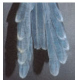
Photo. 2. Juvenile tail feathers