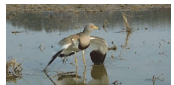
Photo 4. Threat behavior to the research worker.