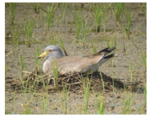
Photo 2. Parent bird incubating in the nest.

They build a nest in wet habitats, such as paddy fields and low grass and bare areas around them, such as ridges, cropland, fallow fields and dry riverbeds. They dig a several-centimeter-deep hole in the ground and line blades and stems of grass collected from the surroundings. The nest is about 20cm in diameter and about 2cm in height. When they build a nest in a marsh, they pile up nest materials higher so that the nest may not be filled with water.