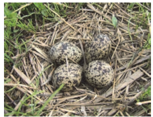
Photo 3. Nest and eggs of Grey-Headed Lapwings