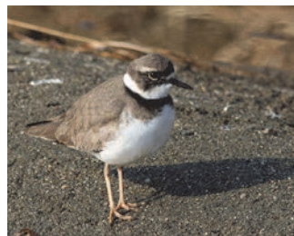
Photo 1. Long-billed Plover male in summer plumage.